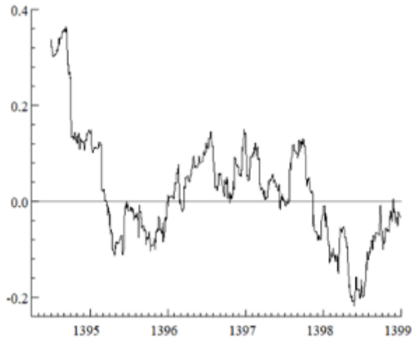
Figure 3. Dynamic Conditional Correlation between Stock and the Dollar Returns of DCC Model.