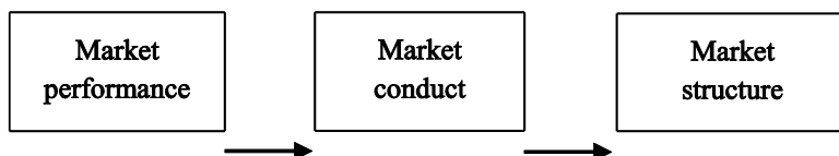
Figure 2.2. Direction of Causality from the Perspective of the Chicago School

In the framework of this school, we have: